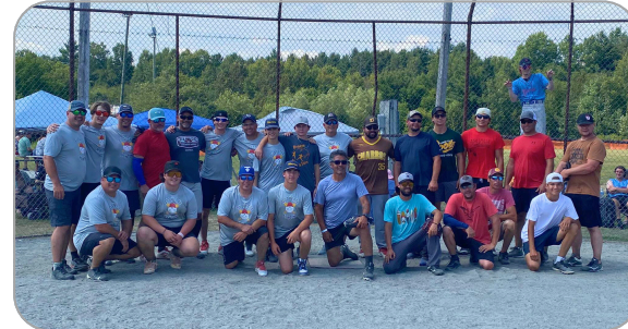
The Dokis men’s team played the Duquette-Newton team in the B division Championship game.