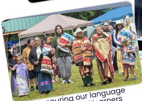
Honouring our language speakers and learners