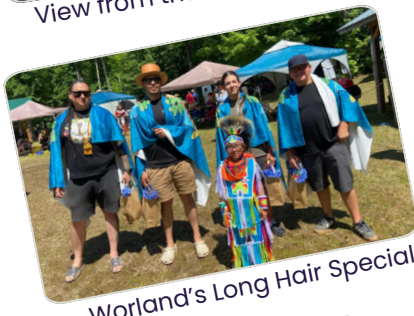
Worland's Long Hair Special