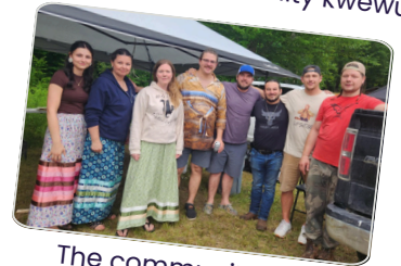
The community feast catering team!