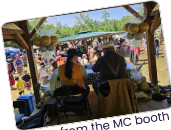
View from the MC booth