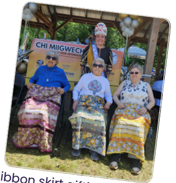
Ribbon skirt gifting to some special community kwewuk