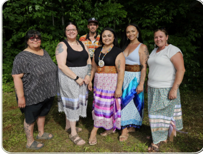
The Pow Wow Planning Committee!