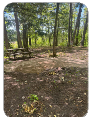
Annah has been doing a lot of work at the Dokis Park in preparation for the summer season! Walking trails have been cleaned up and groomed. The picnic and campsites are also being maintained and leveled out. Community members are welcome to explore the trails, enjoy the beautiful views, and stop for a picnic lunch in Dokis Park!