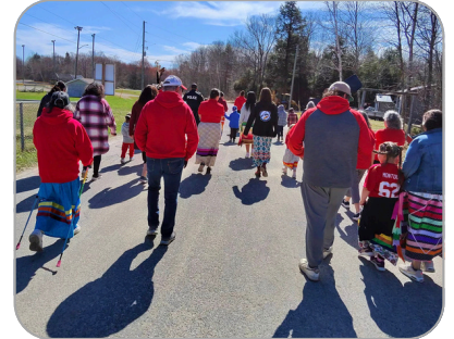
The Missing and Murdered Indigenous Women and Girls walk on May 5th had lots of support from students and community members.