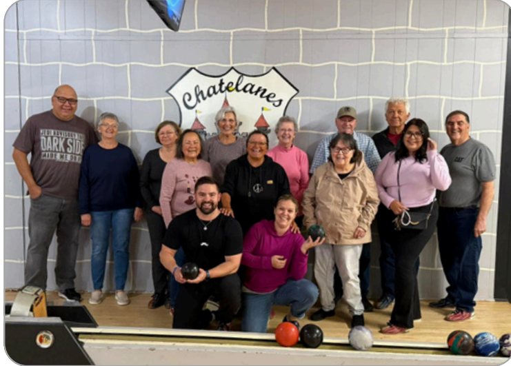
Members of the Active Living Program took their annual trip to the Chatelanes bowling alley in Sturgeon Falls in May.