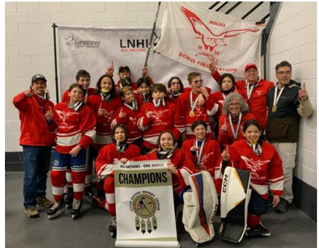
DOKIS U13- B CHAMPS

Last year, the U13 Dokis team brought home B-Champs in the Competitive Division and the U9 team brought home E-Champ in the Recreation Division.