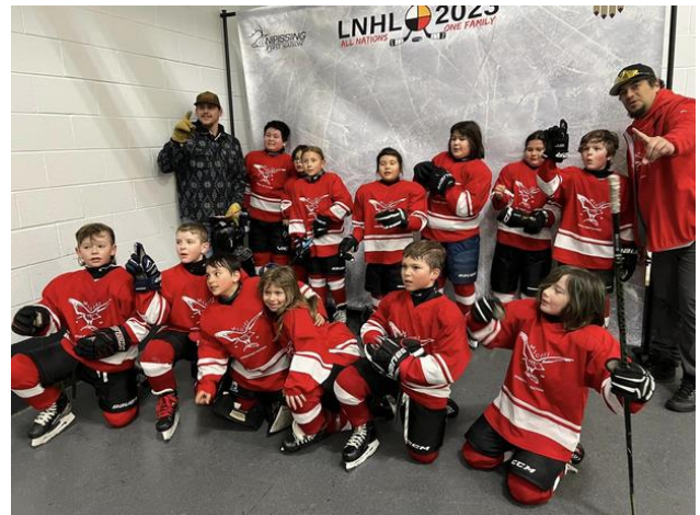
DOKIS U9 DIVISION